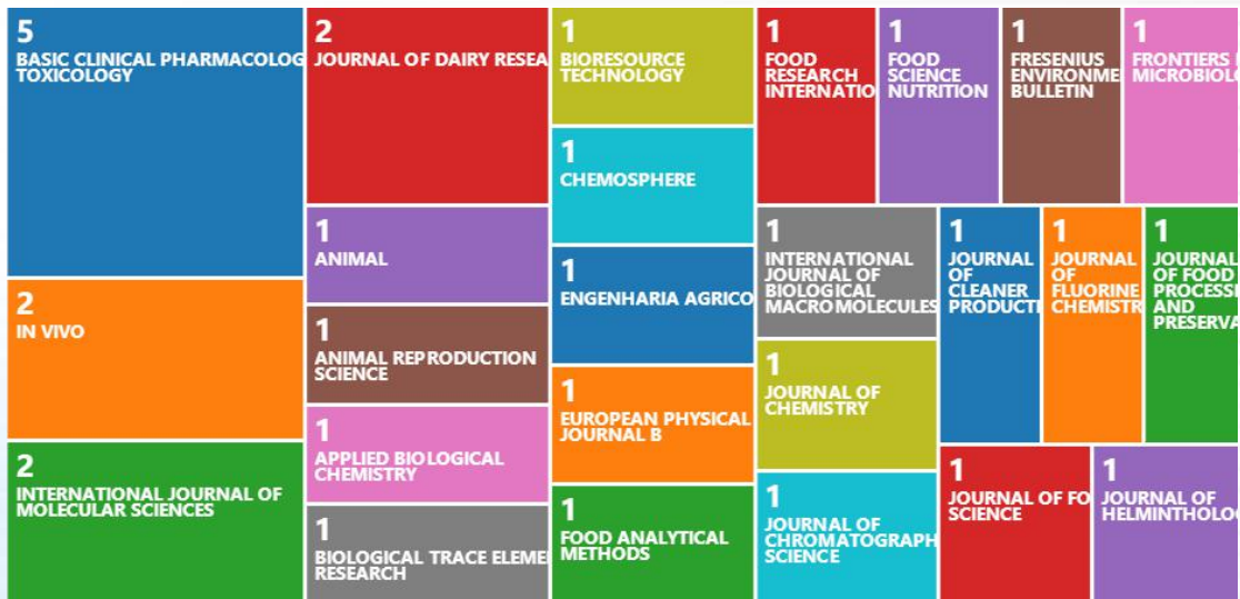
图 3 发文≥1 篇来源出版物分布图