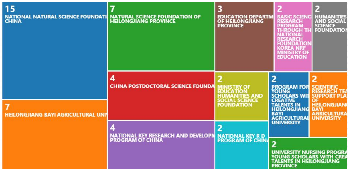
图 2 发文≥2 篇基金资助机构分布图