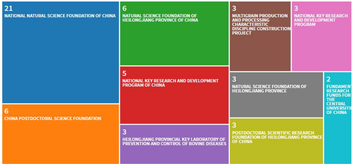
图 2 发文≥2 篇基金资助机构分布图