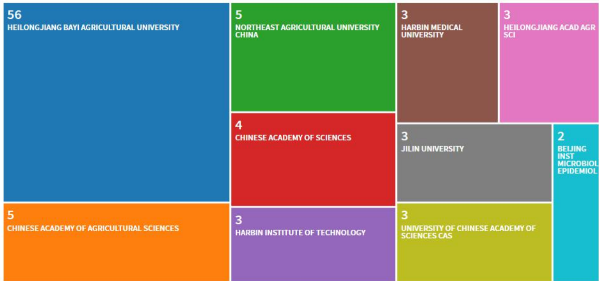
图 1 发文≥2 篇合作研究机构分布图